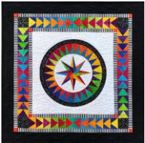
HAPPINESS 2.0 (3)