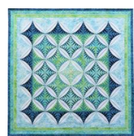
WALK IN THE WOODS (4)