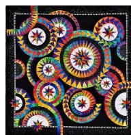
ENCHANTING STARS (6)