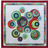
DREAM FLIGHT (5)